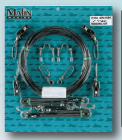
TOP ANGLER RIG KIT 1 Outside Halyard 2 Inside Halyard 3 Pulley with Snap 4 Pulley with Snap Swivel 5 Shock Cord 6 SS Eye Strap 7 Crimp Sleeve 8 Snap No Release Clips